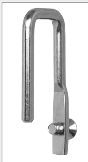
Anchor for NEW Rubbermaid® and Roughneck™ sheds (Item # 5L10, 5L20, 5L30 and 5H80)

Wall anchors attach easily to holes in pegboard or shelving uprights.*